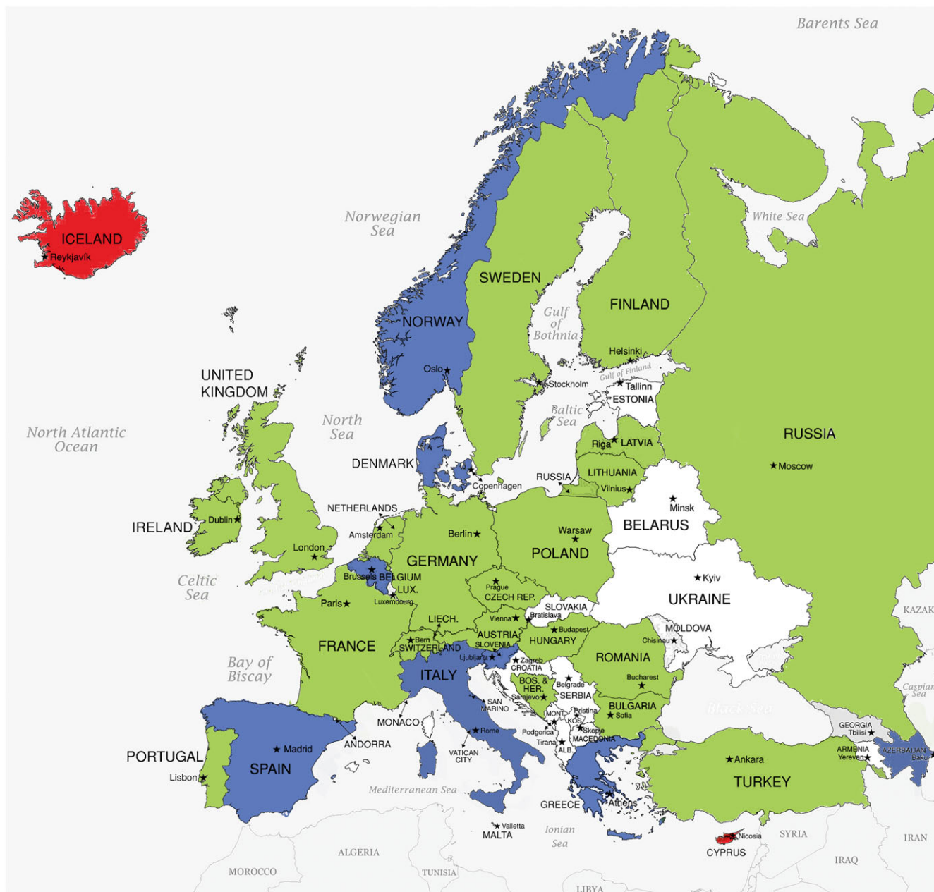
Figure 2. Paediatric cardiology training programme status across AEPC countries. Green represents a country with a formally recognised paediatric cardiology training programme. Blue represents a country with informally recognised paediatric cardiology training programme or partial training with a partner country. Red represents a country with no paediatric cardiology training programme. White represents a country which did not participate in the study.