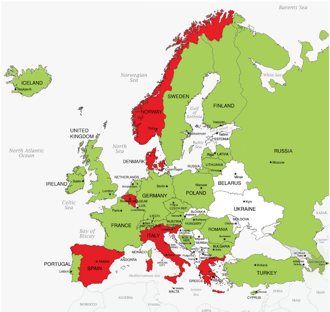
Figure 3. Paediatric cardiology subspecialty recognition by governments across AEPC countries. Green represents countries whose Ministry of Health recognise paediatric cardiology as a distinct subspecialty. Red represents countries whose Ministry of Health do not recognise paediatric cardiology. White represents a country which did not participate in the study.

training ( n = 26 ), neonatal intensive care ( n = 18 ), or paediatric intensive care training ( n = 11 ). Only eight countries matched training posts with the need for consultant paediatric cardiologists at the end of training period. Some countries reported dual entry possibilities from paediatrics or from adult core training to paediatric cardiology as well as adult CHD training.