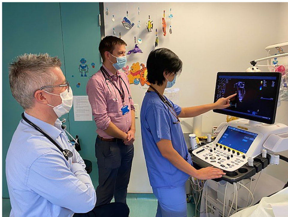
Figure 1. Competency-based medical education. A paediatric cardiology fellow undergoes end of year assessment by two trainers at an OSCE echocardiography station. Entrustable professional activities are increasingly being used to bridge competencies and clinical practice with trainees assessed on their capability (entrustment scale).

However, the training is either not formally recognised (accredited) or the Ministry of Health in that country does not (or refuses to) recognise paediatric cardiology as a distinct subspecialty of medicine.