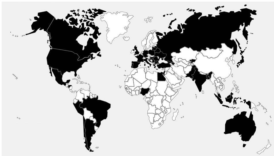
Fig. 1. Map of the 40 participating countries.