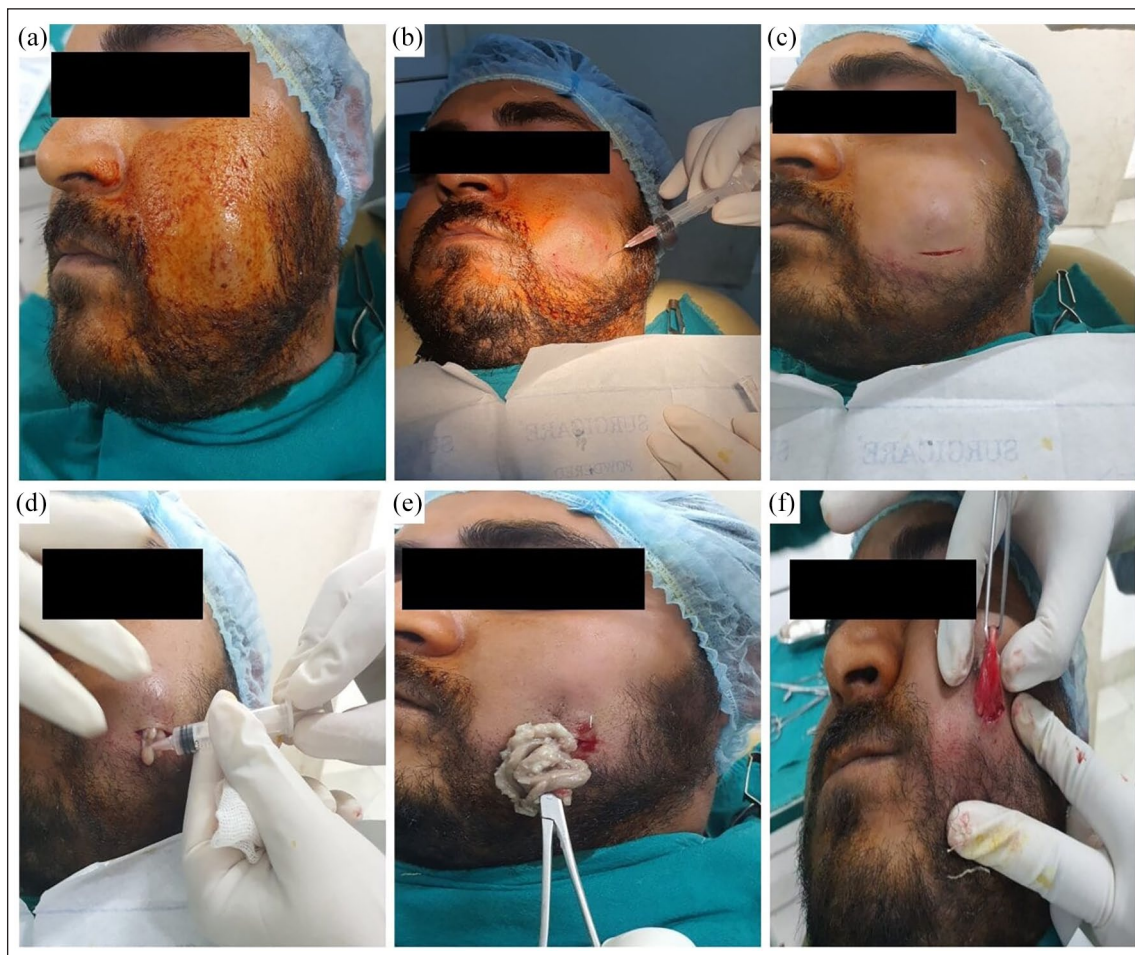
Figure 2. Preparation of incision site, collection of exudate and complete removal of cyst. (a) Under aseptic condition (using betadine solution) the facial hair were trimmed; (b) aspiration did not yield any results due to the cheesy thick swelling contents; (c) horizontal stab incision was given; (d and e) Cheesy, keratinous, granular, paste-like semi-solid discharge from the swelling site and (f) complete removal of cyst wall lining.

wall, thereby confirming the diagnosis of epidermoid cyst. No inflammatory infiltration was noted in the sample.