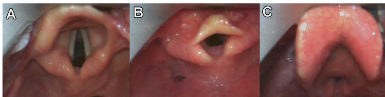
Fig. 2. Visualisation of laryngeal structures, using Storz C-MAC, equipped with D-blade. A - C-L grade 1; B - C-L grade 2; C - C-L grade 3