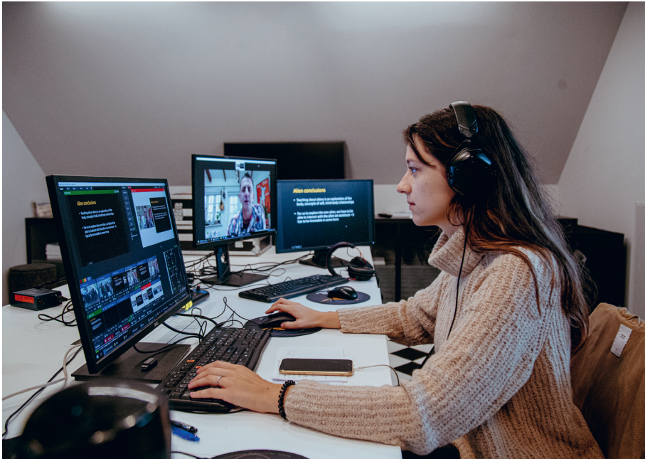
Figure 5. Thirty-eight hours of online broadcast of the ISHM congress in Riga.