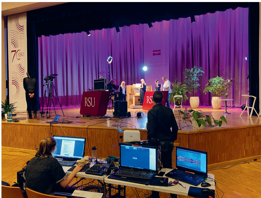
Figure 2. Preparation for the virtual opening of the 47th ISHM Congress in Aula Magna of the Rīga Stradiņš University. 24 August 2020.

event: outcome of the submitted abstracts, a preliminary scientific and social program, and a pre-congress communication plan for delegates and media. At that moment, no one could have imagined how much more different the outcome would be. Two months later, the organizers had to announce a change of plans. After carefully evaluating the global development of the SARS-CoV-2 pandemic, they approached the ISHM Executive Bureau with the proposal to change the dates for the 47th ISHM Congress in Riga to 23–27 August 2021 and got approval. The health and safety of delegates, speakers, and sponsors was the most important priority; the date for the Virtual Opening Ceremony of the 47th Congress of the ISHM remained as it was initially established, 24 August 2020.