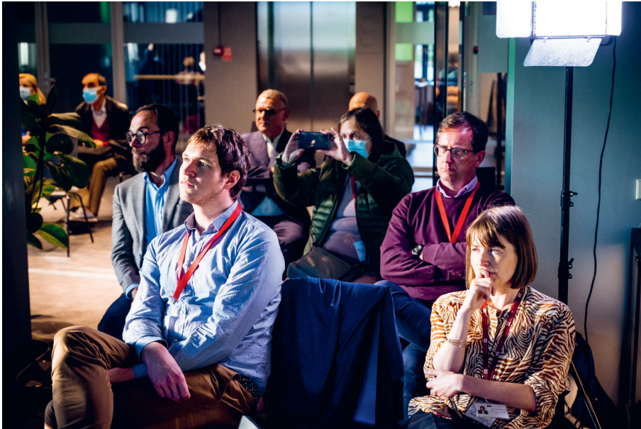
Figure 8. Onsite participants of the panel discussion.