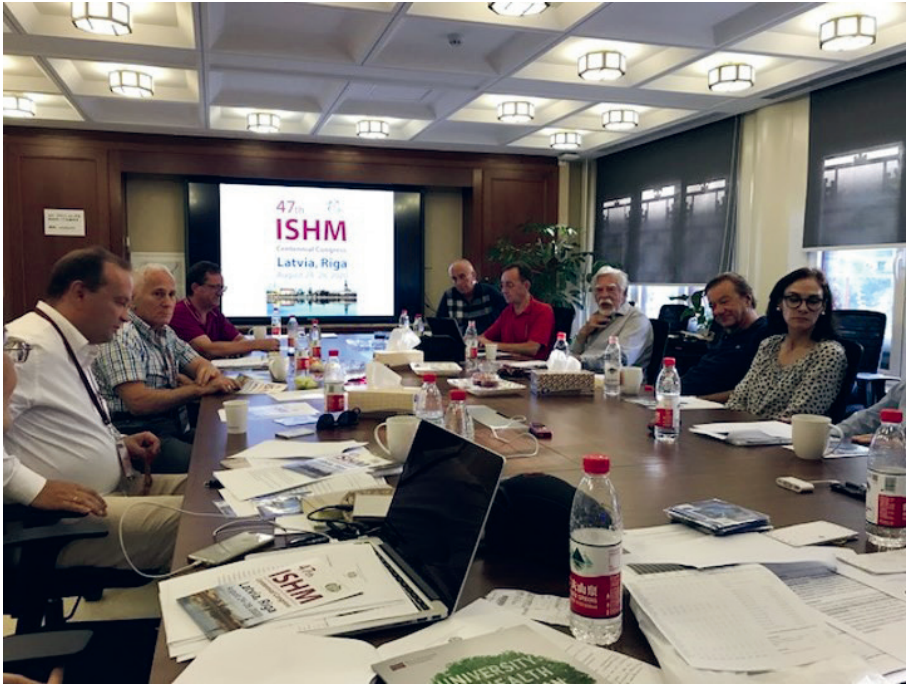
Figure 1. The Executive Committee of the ISHM approved Riga as the venue for the 47th ISHM Congress. Beijing, September 2017.