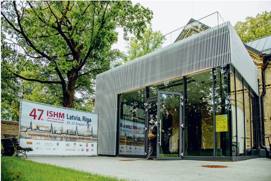
Figure 4. RSU Anatomy Museum—the venue of the 47th ISHM Congress.