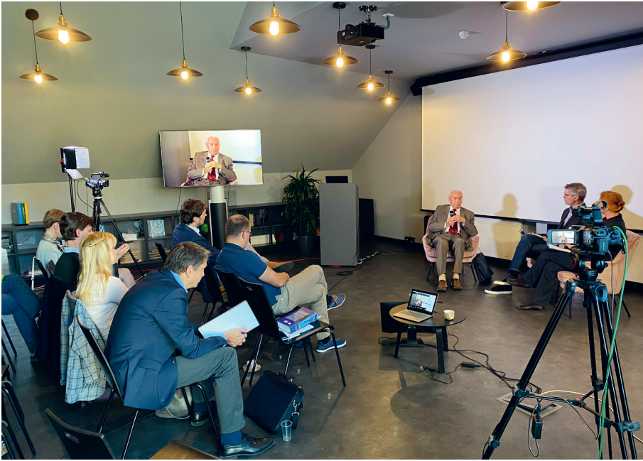
Figure 6. Interview with former Minister of Foreign Affairs of the Republic Latvia, Dr. Georgs Andrejevs.