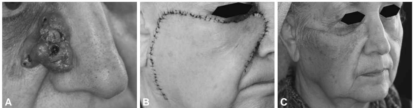
Fig 1. A – case classified as Group IV or mixed BCC histology subtype, larger than 20 mm and located in the nose region. B – the patient was treated with WE method and margins were stated as clean. C – after 4 months no recurrence was detected.