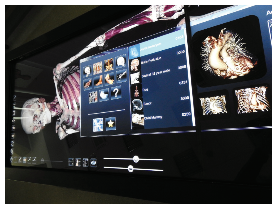
Figure 1. Some possibilities of the Virtual Dissection technology Anatomage.

The Department of Morphology enabled new possibilities and allowed the students to learn anatomy through a high-quality and interactive, virtual 3D tool (Fig. 1). The sample included Latvian and Foreign students and several tutors from the Human Anatomy course in the period of 2016-2017. This study was conducted in a real practical class context and under actual learning conditions. The Anatomage Table was used in two or three semester courses for the students of the Faculty of Medicine and the Faculty of Dentistry. None of the participating students had ever worked with the Table. Practical classes involved the students gathered around the Table locating various anatomical or pathological structures as requested by the tutor (Fig. 2). The tutors served as facilitators guiding the students through the learning and developed the groups of students and the discussion questions based on previous experience and knowledge. In a practical class the following activities were used: viewing and dissecting the anatomy based on various body systems in different planes and images, and the analysis of the pathology case studies. Students were randomized between two methods. In practical classes the learning, comparison