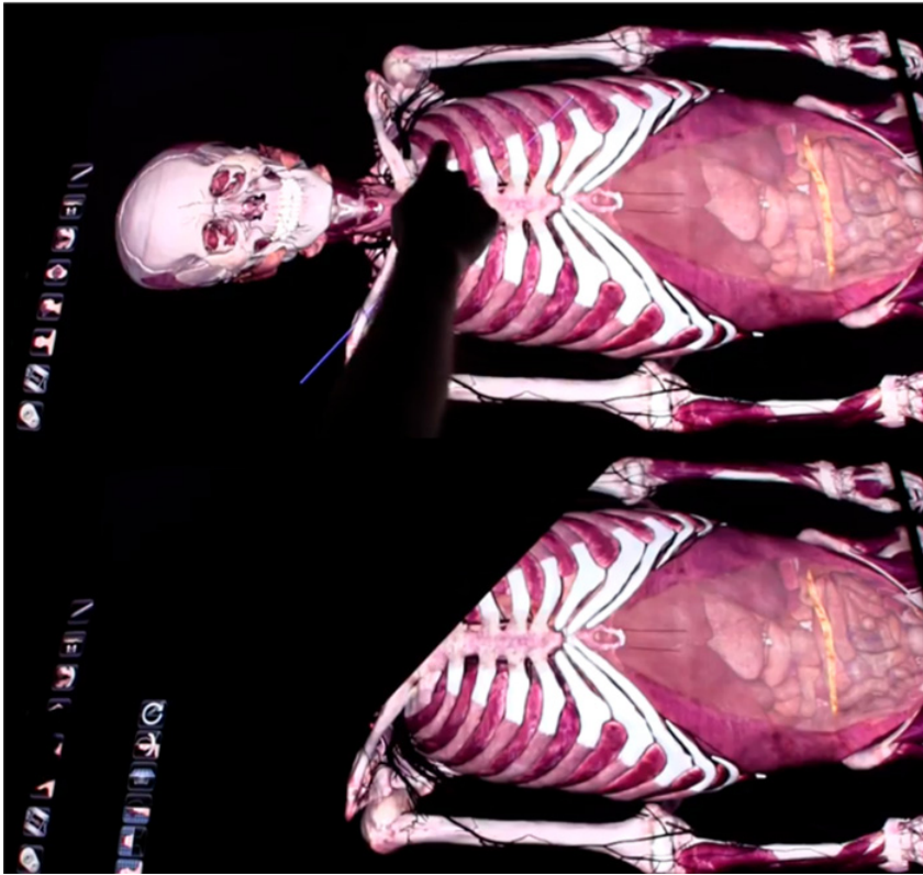
Fig. 1. The application of scalpel for straight line area – step 1 and step 2.

efforts in teaching [8–11]. It is very important that students are learning not only basics, but also how to use technologies that they have.