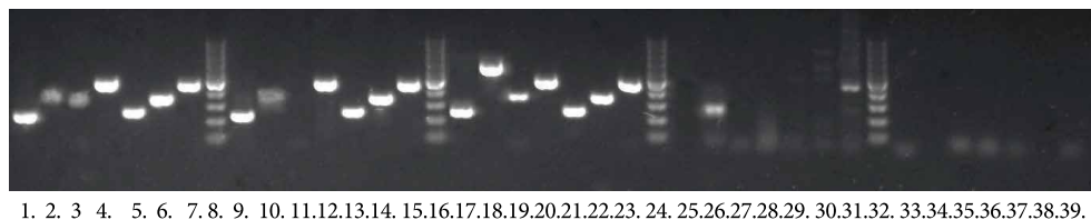
FIGURE 1: PCR products of all tested AZFa region markers. 1000 bp ladder was used as the size control (lanes 8, 16, 24, 32). Lanes 1–7: Patient's DNA sample. Lanes 9–15: DNA sample of the father of patient. Lanes 17–23: Positive control (healthy male without AZF deletions). Lanes 25–31: Negative control (male with full AZFa deletion). Lanes 33–39: No template control. For each sample, PCR products representing the tested markers are shown in following order: sY85: lanes no. 1, 9, 17, 26, 33; sy84: lanes no. 2, 10, 18, 26, 34; sY1323: lanes no. 3, 11, 19, 27, 35; USP9Y-44: lanes no. 4, 12, 20, 28, 36; sY87: lanes no. 5, 13, 21, 29, 37; sY1234: lanes no. 6, 14, 22, 30, 39; DDX3Y-16: lanes no. 7, 15, 23, 31, 39.