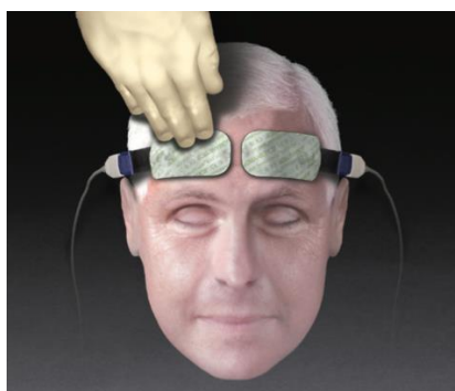
Figure 1. INVOS (IN Vivo Optical Spectroscopy) sensor placement on the patients' forehead.

In all patients rScO 2 was continuously monitored throughout the surgery, using NIRS device INVOS (IN Vivo Optical Spectroscopy) 4100 (Covidien, Minneapolis, MN, USA). The INVOS system utilizes near-infrared light at wavelengths that are absorbed by hemoglobin—730 and 810 nm. Two rScO 2 sensors were placed on the patients' forehead; one above the right (R) and one above the left (L) cerebral hemisphere after arriving in the operating room. One adhesive INVOS sensor pad was attached above the right eyebrow, the second above the left eyebrow (Figure 1). The distance between the light emitting diode (LED) and two INVOS sensor detectors was 3 and 4 cm (Figure 2). Sensors were connected to the INVOS monitor. The initial values on the screen were set as baseline rScO 2 values. The patient is breathing room air before induction of anesthesia. By establishing baseline rScO 2 values, INVOS further tracks the changes in rScO 2 values for the left side and for the right side (Figure 3).