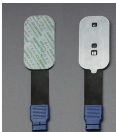
Figure 2. INVOS sensor (picture taken from The INVOS Cerebral/Somatic Oximeter Operations Manual, Covidien 2010).