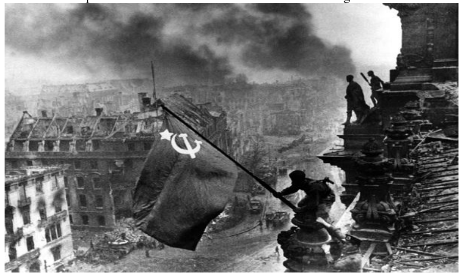
2. Original picture with two watches